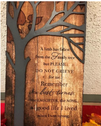
Tribute to Fallen Marines Det 577