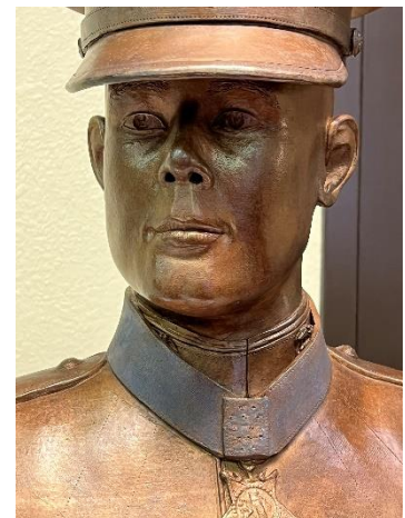
Woody's Bust up close