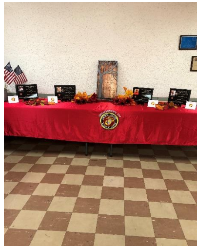
Tribute to Fallen Members 577