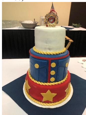
The Layered Cake