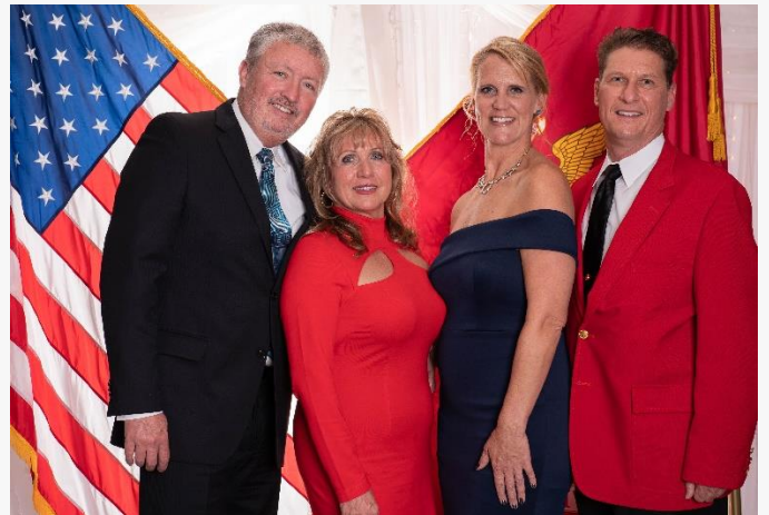
Members and Guests of Det 342's MC Birthday Ball