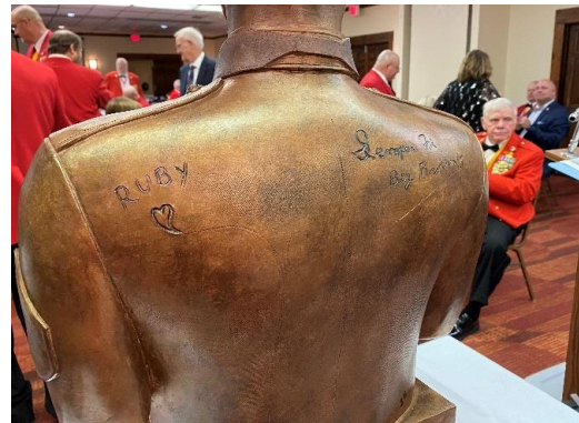
Backside of the Bust (Ruby, Woody's wife)