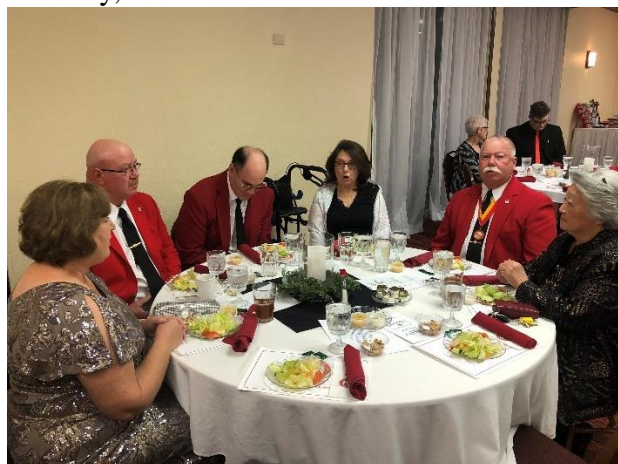
Members of Ripley Det 1065