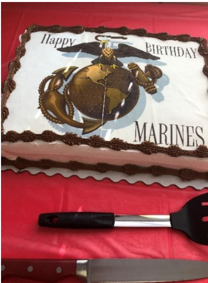
Det 577 246 th MC Birthday