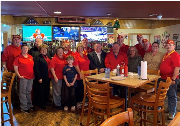
Members and Guests of Huntington Det 340

The Huntington Det 340 has just celebrated their 50 th Anniversary Dec 4, 2021!! Congratulations, Huntington!! (Actual Anniversary was November 12, 1971)