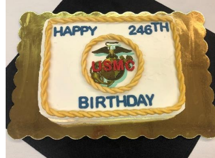
MC 246 th Birthday Ball @ MGM 1180