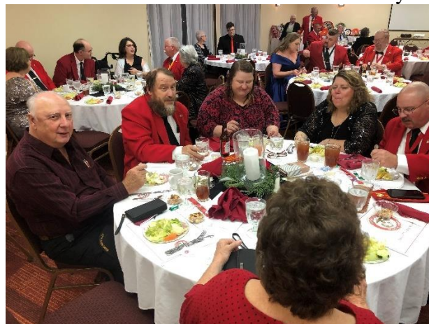
Members and Guest of Huntington Det 340